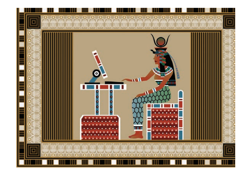
"On the Internet, nobody knows you're an Egyptian goddess..."