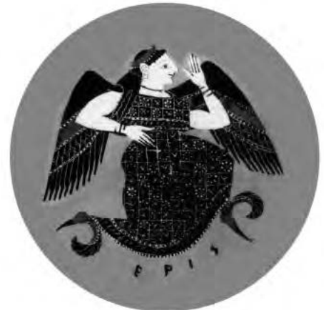
Eris, goddess of chaos, strife and discord, ca 550 BCE

11 19, which was in orb to square the U.S. Sun. This is the time the U.S. was embroiled in protests over the rights and treatment of not just native and African Americans, but also the Vietnamese. Eris exactly squared the U.S. Sun several times, as Nixon and his staff were caught spying on the Other party, and the U.S. began an ignominious exit from the Vietnam War. As you can see, the U.S. chart and its progressions and transits are more powerful evidence that Eris is Other.